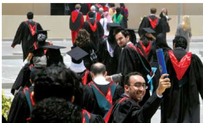
RCSI Bahrain conferred its first class of healthcare professionals in June 2010.

RCSI Bahrain is located on a site provided by the Government of the Kingdom of Bahrain, adjacent to the King Hamad General Hospital and RCSI Bahrain Health Oasis sites. The entire concept extends over a combined site of circa 60 hectares. Together these inter-related components will form a truly unique medical education and healthcare campus.