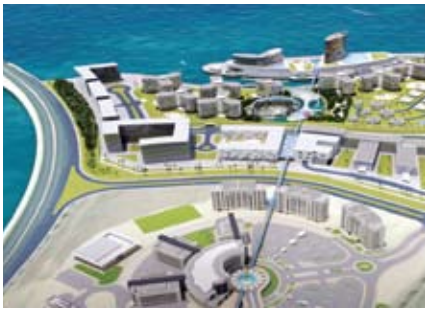
RCSI Health Oasis Preliminary Masterplan.