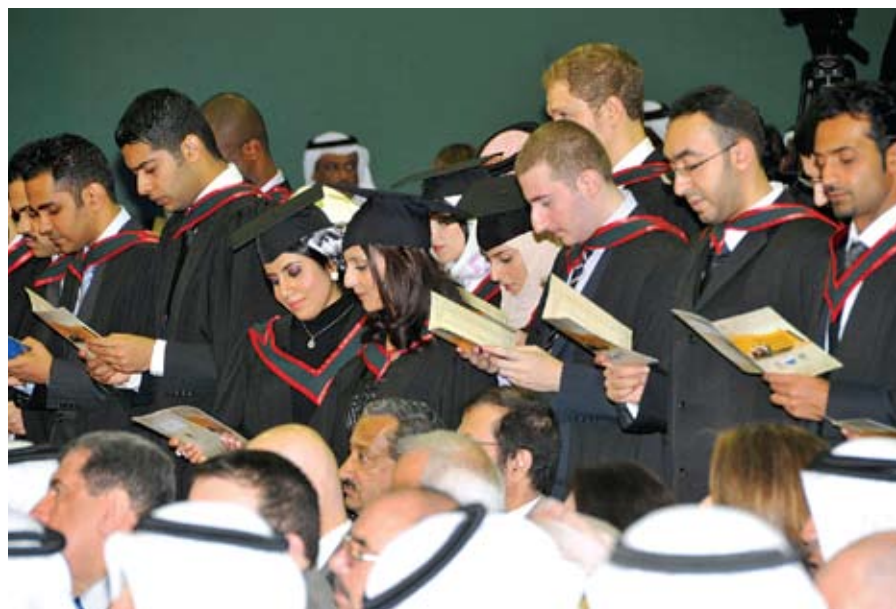
Students at the inaugural graduation ceremony at RCSI Bahrain in June 2010.

When developed, the Health Oasis will represent a truly unique medical education and healthcare campus within a world-class, mixed-use waterfront development – an international healthcare centre of excellence and enterprise for the Kingdom of Bahrain and the Middle East. When completed, it will integrate world-class healthcare, state-of-the-art medical education and research, and health sector enterprises in an unprecedented environment designed to foster novel approaches to healthcare and healthcare delivery. It will be unlike any existing or proposed health or wellness centre in the region. It will combine an extensive and comprehensive provision of international standards and RCSI-led medical and healthcare excellence with state-of-the-art medical enterprises in a high amenity, waterfront environment.