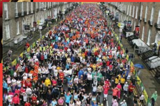
Hundreds run the Mini Marathon for Breast Cancer Ireland.