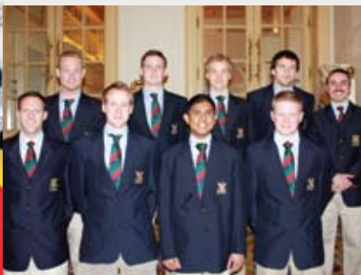
RCSI Boston Marathon team.