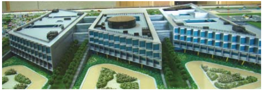
Model of King Hamad General Hospital.