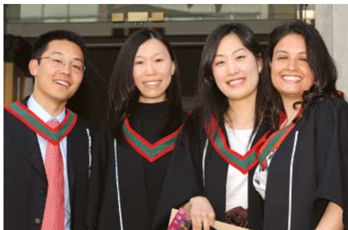
Students who received their medical degrees at the RCSI Annual Graduation Ceremony in the National Concert Hall in June 2010.