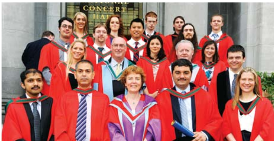
Postgraduate students pictured with RCSI staff at the Annual Conferring Ceremony in June 2010.

The School of Postgraduate Studies endeavours to promote fourth-level education in RCSI and to play a major role in achieving Irish Government policy of enhancing postgraduate and postdoctoral education and training. The introduction of structured PhD programmes is an important part of the evolution of fourth-level education. These programmes offer a breadth of relevant training through taught modules and laboratory rotations or research placements in year one, followed by in-depth PhD projects with continuous transferable skills training and overseas university or industry placements in years two to four. RCSI currently participates in five such programmes, either as lead partner or collaborating institution. Two RCSI-led programmes are the HRB PhD Scholars' Programmes in Diagnostics and Therapeutics for Human Disease (RCSI/Beaumont Hospital/DCU) and Health Services Research (RCSI/UCC/TCD).