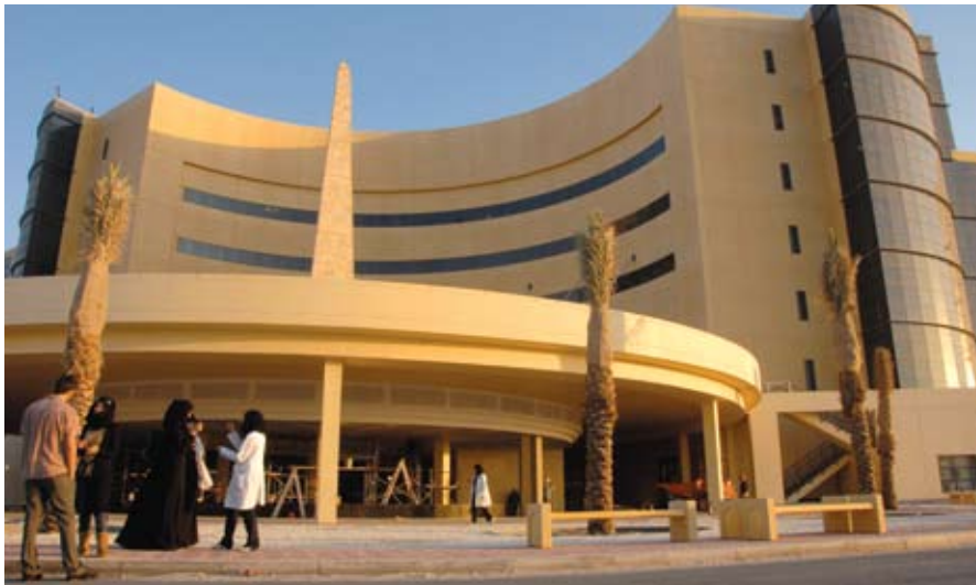
Royal College of Surgeons in Ireland Medical University of Bahrain

The Oasis Private Hospital will perform a central role and deliver much of the specialist medical care within the Oasis. In doing so, it will have the support of the King Hamad General Hospital (KHGH) and RCSI Bahrain. The activity and speciality mix will complement that of the KHGH and will be consistent with the overall target market.