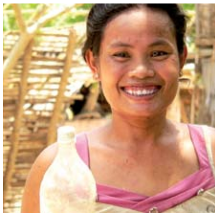
A Cambodian mother with her well-used SODIS bottle. SODIS has been a major public health success, using solar disinfection of drinking water to protect against diarrhoeal diseases.