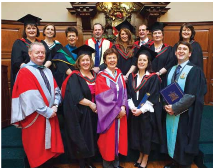
Pictured at the November conferring are RCSI staff:

The coming academic year will see the introduction of two new Masters Degrees and a new Diploma in Leadership. In collaboration with Dublin City University (DCU), the Institute will provide a bespoke DCU/NUI-accredited MSc in Organisational Change and Leadership for Beaumont Hospital and the Connolly Hospital Blanchardstown. Starting in October 2010, the programme, the first of its kind in Ireland, will develop the management and leadership cadre of the hospital. We will also deliver a new MSc in Leadership in Health Professions Education, which will harness participants' potential to become educational leaders in the health professions. The programme is unique in that it combines education in leadership with the principles and practice of curriculum design, instruction, assessment, research and evaluation.