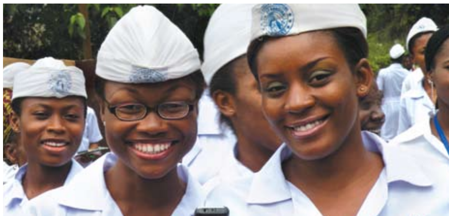
Student nurses at the opening of a new state-of-the-art out-patients and casualty department at the Holy Rosary Hospital, Emekuku, Nigeria, in November 2009.