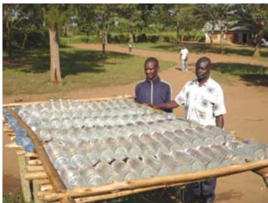
Teachers at a Ugandan primary school proudly display their harvested rainwater which has been set out for solar water disinfection (SODIS).