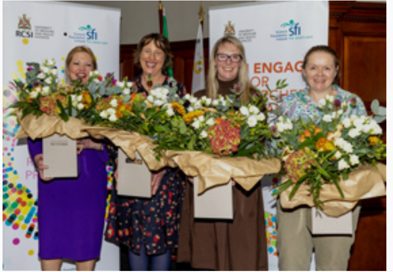
Recognising the valued input of community partners at Junior Researcher Science Week Mini Symposium.

Participants learning CPR skills during RCSI Transition Year (TY) Programme.