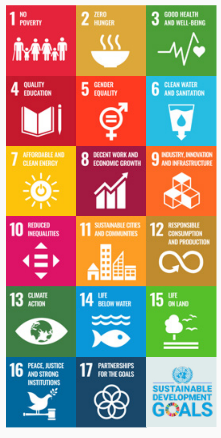
Figure 1: UN Sustainable Development Goals

1 https://www.gov.ie/en/publication/8c8bb-esd-to-2030-second-national-strategy-on-education-for-sustainable-development/