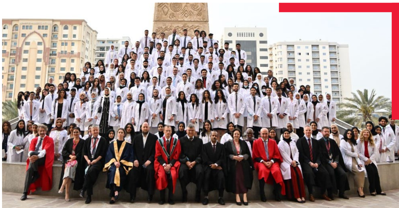
2022 White Coat Ceremony