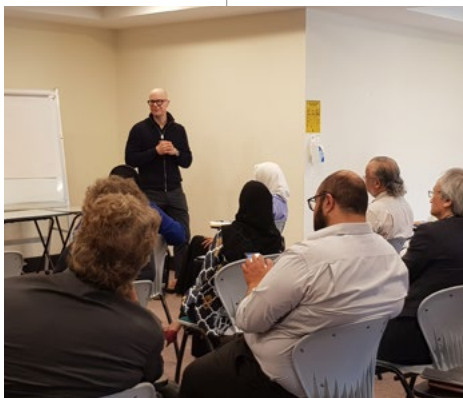
April Advanced Clinical Simulation Training