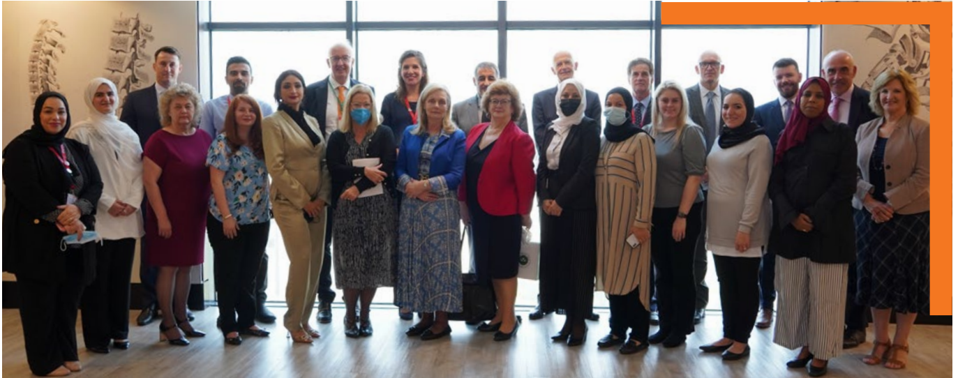
Advance HE 2022 cohort with RCSI Executive members

RCSI Bahrain's accreditation standards, world-renowned curriculum and continuous efforts to cultivate an enriching personal and professional environment, strive to nurture graduates with the knowledge, experience and skills to support the development of national healthcare programmes and become future healthcare leaders. At the heart of RCSI Bahrain's commitment to development and enhancement, lies our collaboration with national and international partners, as well as regular benchmarking against the highest standards.