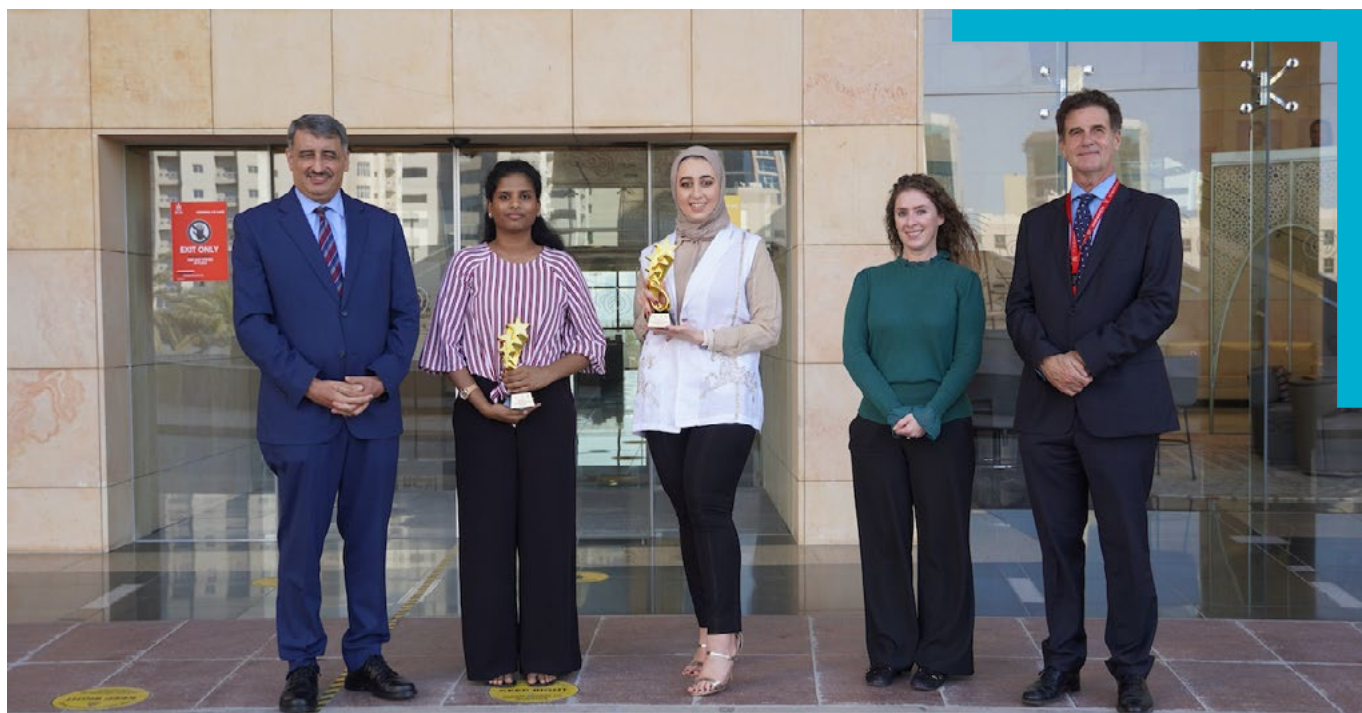
National Research Competition Prize winners with RCSI Bahrain Executives and Faculty member