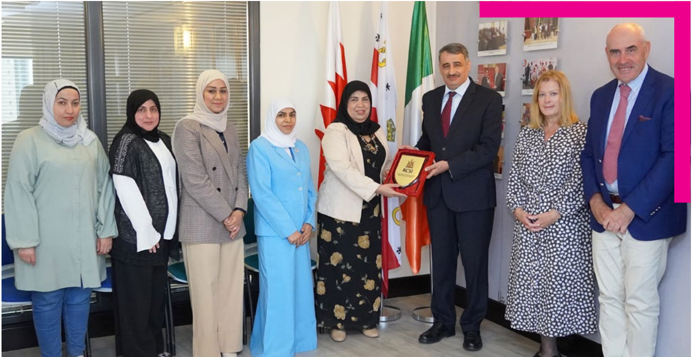
Nursing Society Board with RCSI Bahrain Executives