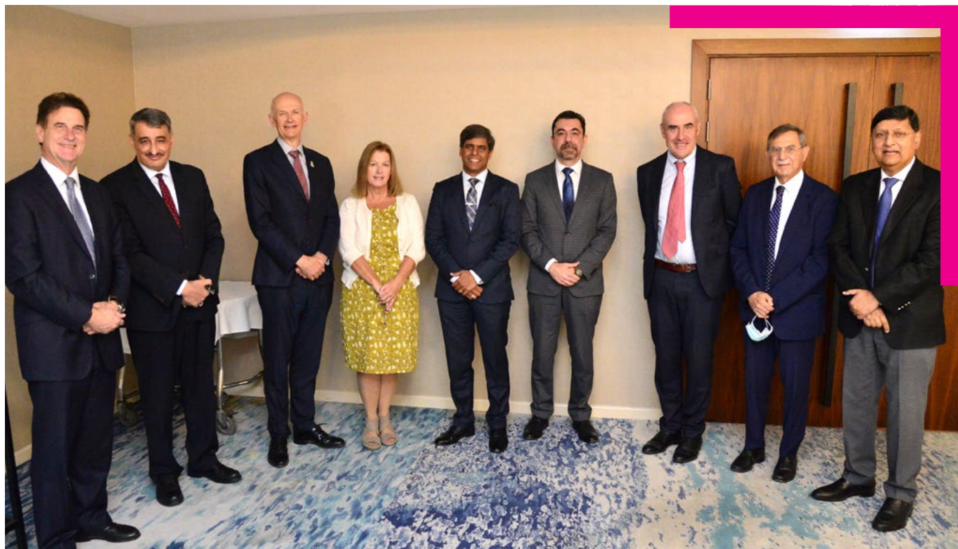
Board Meeting with Tamkeen and Private partner hospitals and Executives of RCSI in Dublin and Bahrain

Forging collaborations with new national and international partners, as well as regular benchmarking against the highest standards, are fundamental to RCSI Bahrain's constant development.