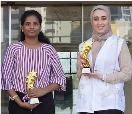
March Medical students win regional competition for COVID-19 research