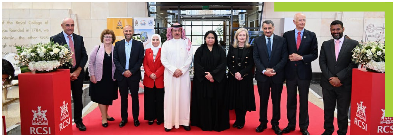
Solar Farm Project Launch in presence of government officials, local partners, executives of RCSI in Dublin and RCSI Bahrain