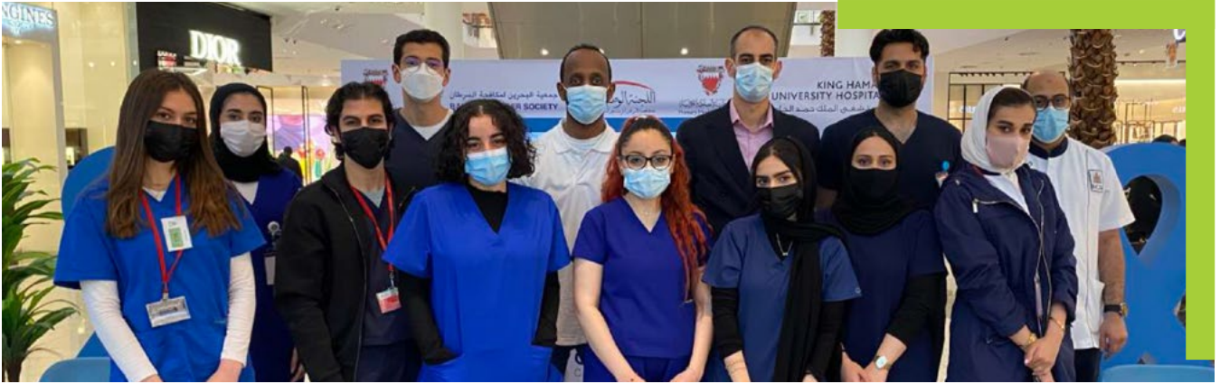
Medical students, nursing students and alumni volunteered in colorectal cancer awareness and screening campaign