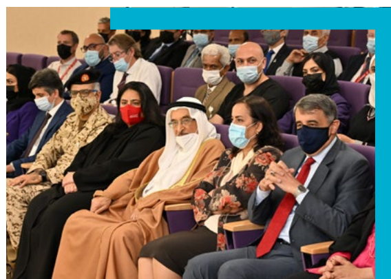
From the Official Opening of the RCSI Bahrain Biomolecular and Clinical Research Centre