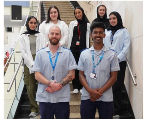
July First Nursing Exchange Placement