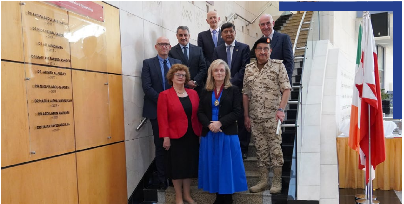
Board of Governors' meeting held on campus in June 2022