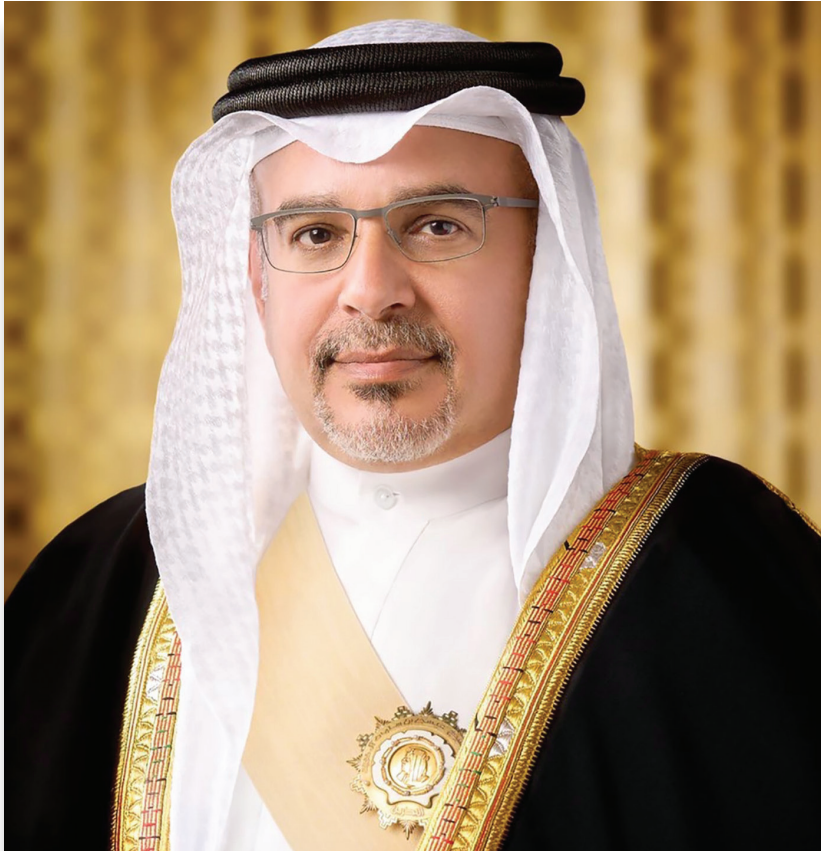
His Royal Highness Prince Salman bin Hamad Al Khalifa The Crown Prince and Prime Minister