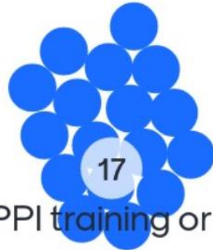
Lack of PPI training or supports