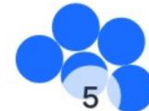
Lack of evidence of its impact