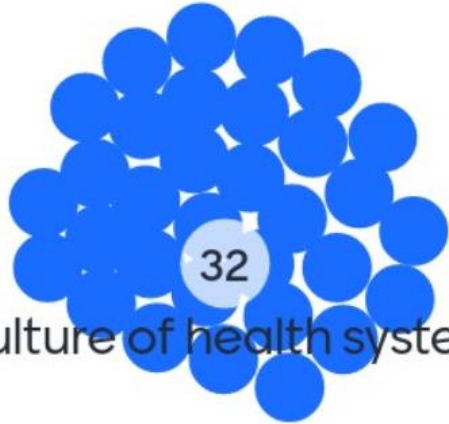
Culture of health system