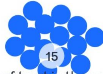
Lack of trust in the service