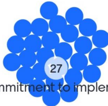
Commitment to implement