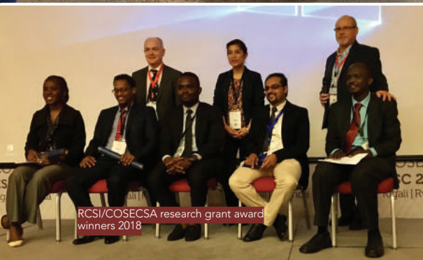
RCSI/COSECSA research grant award winners 2018