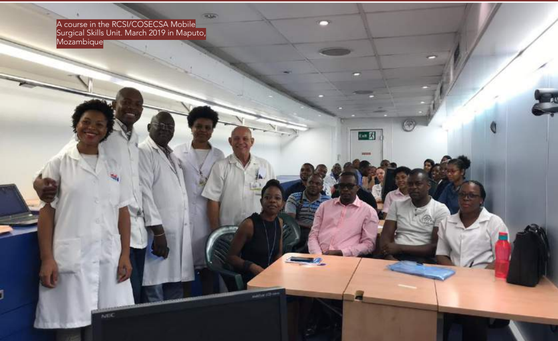
A course in the RCSI/COSECSA Mobile Surgical Skills Unit. March 2019 in Maputo, Mozambique