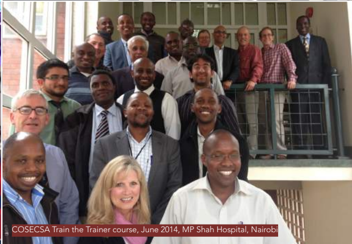
COSECSA Train the Trainer course, June 2014, MP Shah Hospital, Nairobi