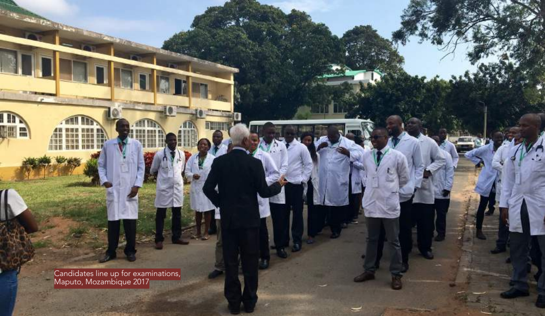
Candidates line up for examinations, Maputo, Mozambique 2017