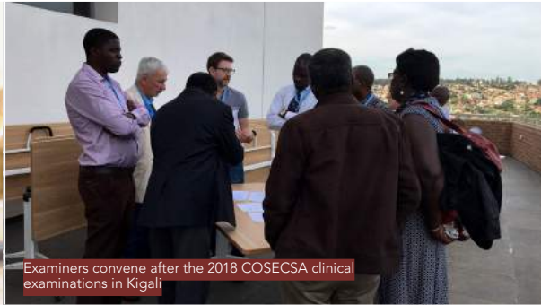
Examiners convene after the 2018 COSECSA clinical examinations in Kigali